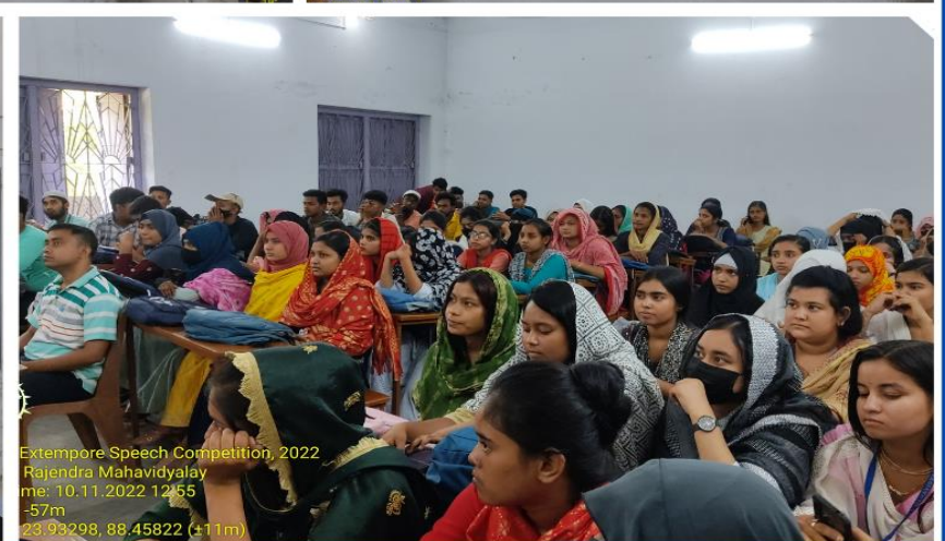
Extempore Speech Competition, 2022 Jatindra Rajendra Mahavidyalay Date & time: 10.11.2022 12:55 Altitude: -57m Phone: 23-93298, 88.45822 (+11m)