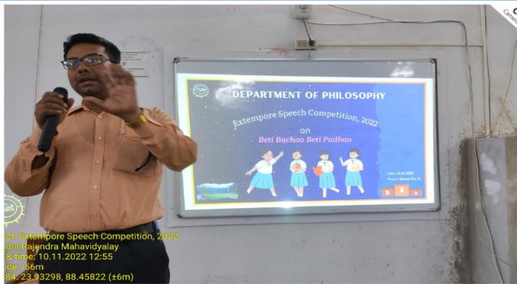
Extempore Speech Competition, 2022 Jatindra Rajendra Mahavidyalay Date & time: 10.11.2022 12:55 Altitude: -57m Phone: 23-93298, 88.45822 (+6m)