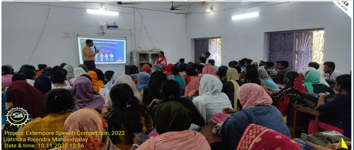
Project: Extempore Speech Competition, 2022 Jatindra Rajendra Mahavidyalay Date & time: 10.11.2022 12:56