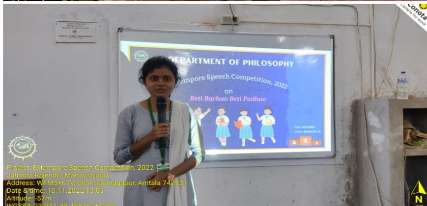
Project: Extempore Speech Competition, 2022 Jatindra Rajendra Mahavidyalay Address: W/M5+67V, Char Suranagapur, Amtala 742121 Date & time: 10.11.2022 13:08 Altitude: -57m Phone: 23-93298, 88.45822 (+10m)