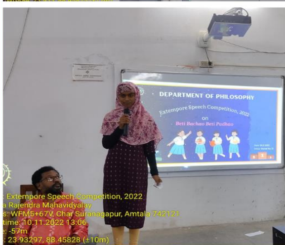
Extempore Speech Competition, 2022 Jatindra Rajendra Mahavidyalay Address: W/M5+67V, Char Suranagapur, Amtala 742121 Date & time: 10.11.2022 13:06 Altitude: -57m Phone: 23-93297, 88.45828 (+10m)