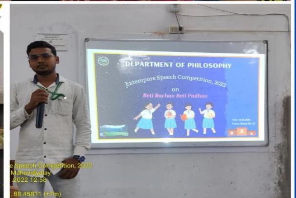
Extempore Speech Competition, 2022 Jatindra Rajendra Mahavidyalay Date & time: 10.11.2022 12:58 Altitude: -57m Phone: 23-93298, 88.45811 (+7m)